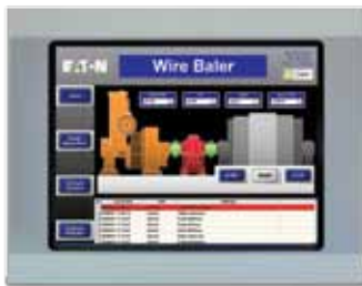
XP: 8.4" to 15" and Blind Node Windows XP Embedded