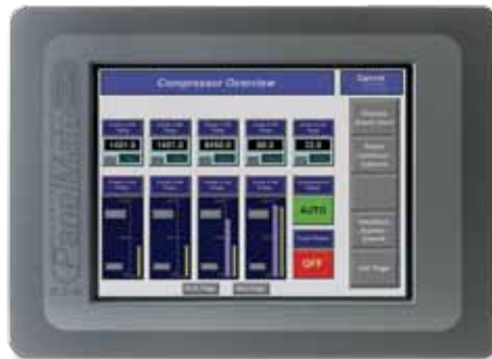
ePro PS: 8.4" to 15" and Blind Node Windows XP Embedded

Three hardware families—one software package